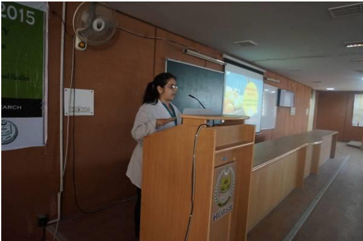
MBBS student presenting seminar on food safety.