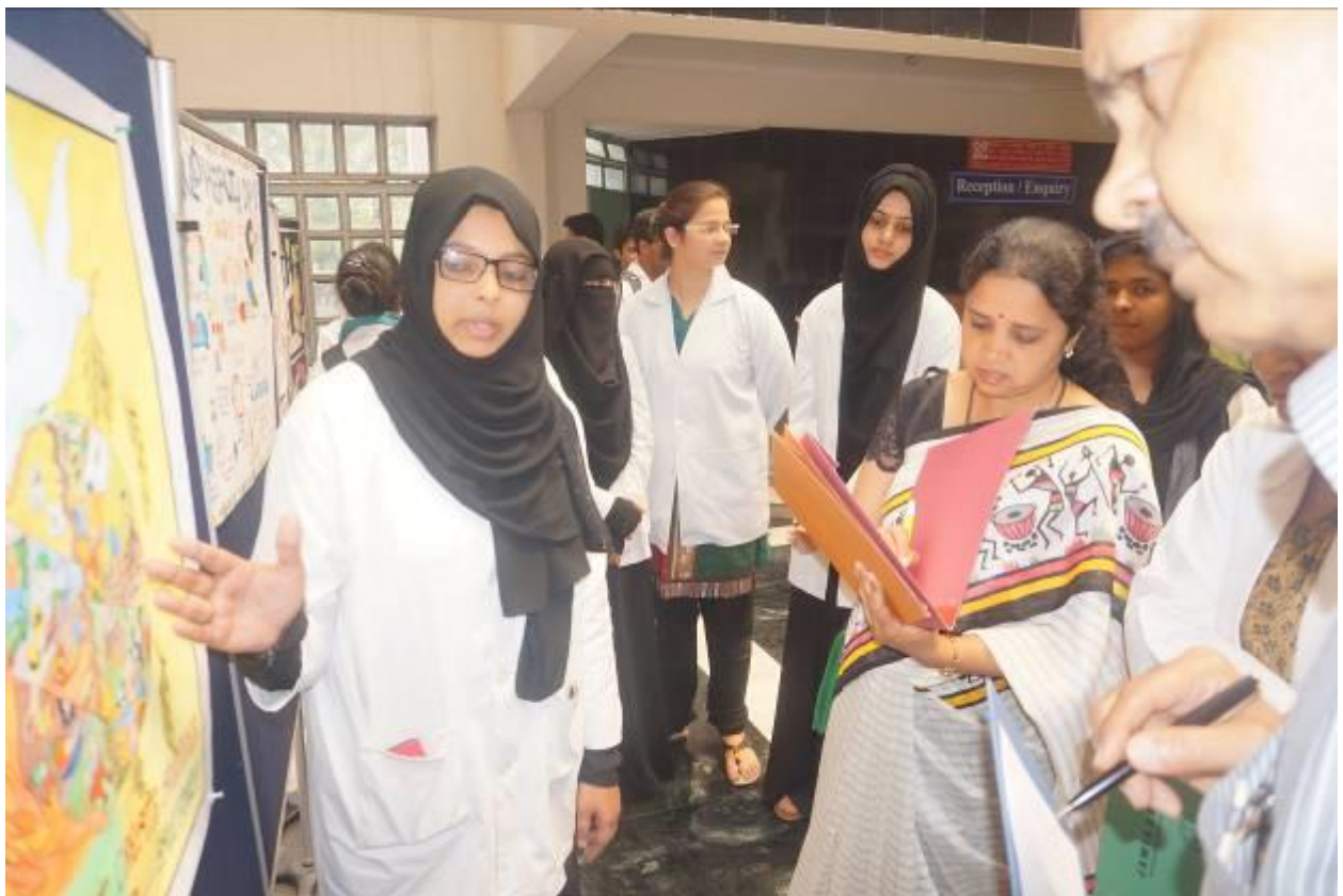
MBBS student explaining the poster to the judges.