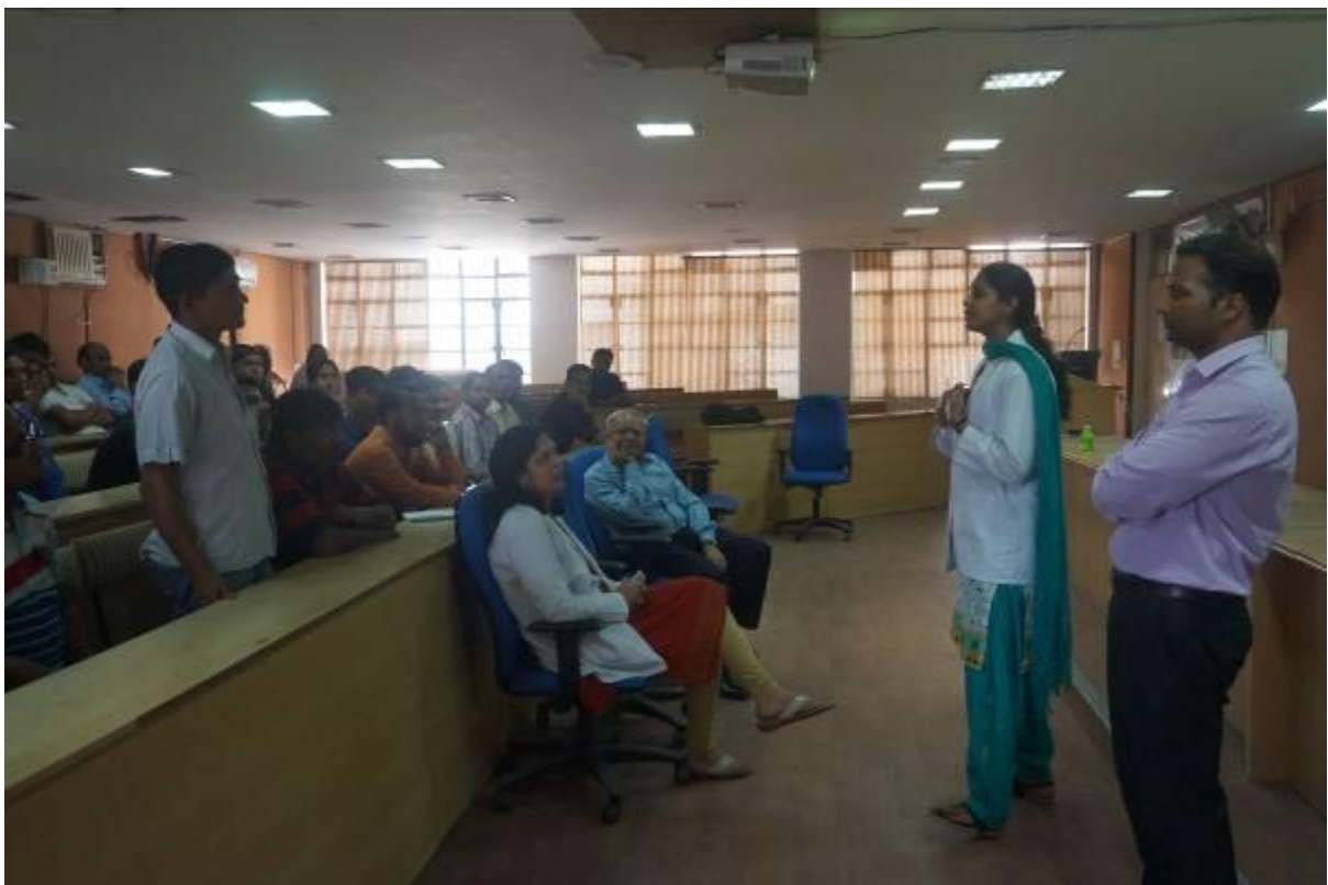
Training of food handlers on food safety at HIMSR.