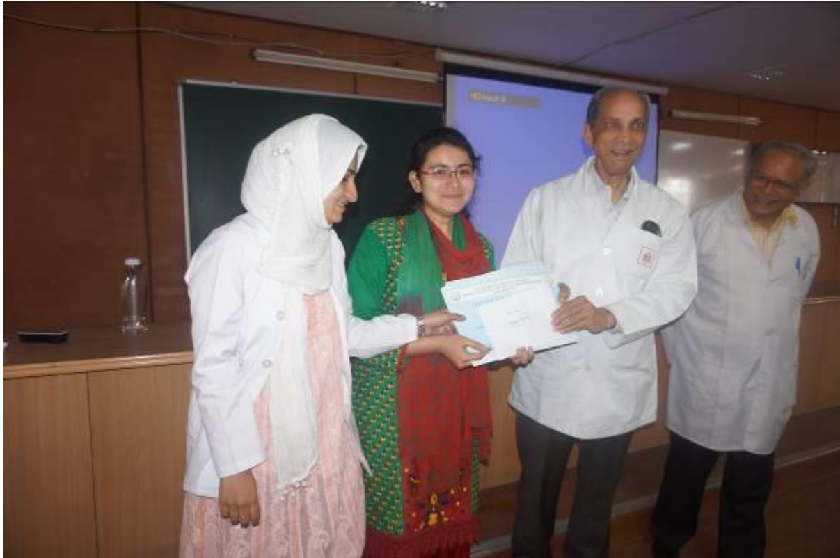
Prize distribution to winners of Poster competition.